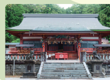
Tonogo Hachimangu Shrine