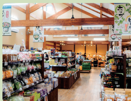
Kaze no Oka (Tono Produce & Souvenirs)